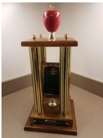
This Big Apple Trophy is a prize for winning the 14th annual "food fight" between Solano and Contra Costa Counties. (Courtesy photo)

FAIRFIELD — Employees for Solano County are picking a fight with their counterparts in Contra Costa County – a food fight that is entering its 14th year.