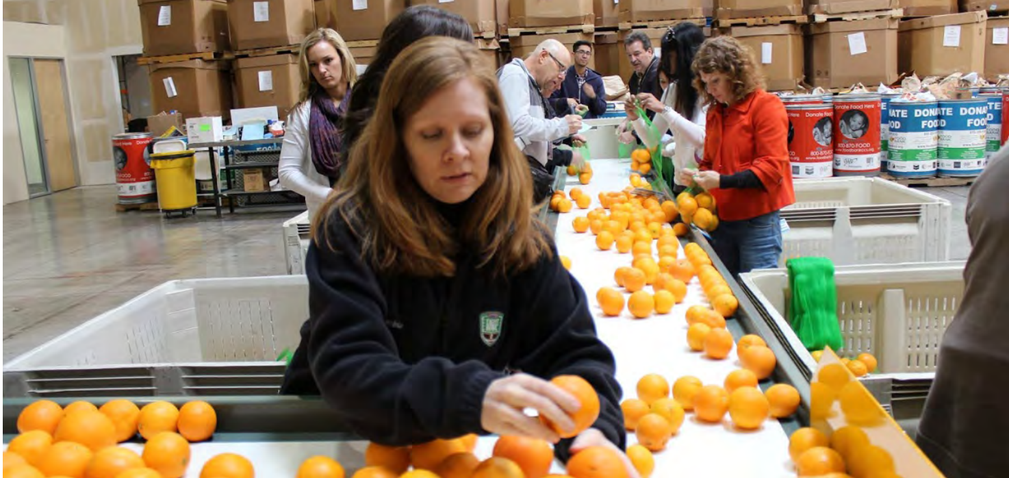
Clockwise from top left - Senior Food Program volunteers, Boy Scouts volunteer and hold food drives, KRAFT and Safeway volunteers in Fairfield