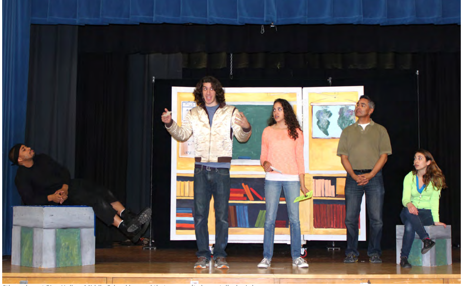
6th graders at Pine Hollow Middle School learned that you can't always tell who is hungry.

The performances carry a powerful message about hunger issues to over 4,000 students, teachers and parents each season. Interest continues to grow for this timely topic. We invite you to find out more about having this play come to your school.