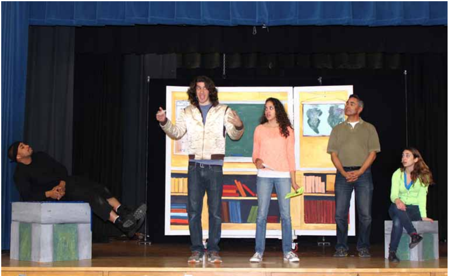
6th graders at Pine Hollow Middle School learned that you can't always tell who is hungry.

The performances carry a powerful message about hunger issues to over 4,000 students, teachers and parents each season. Interest continues to grow for this timely topic. We invite you to find out more about having this play come to your school.