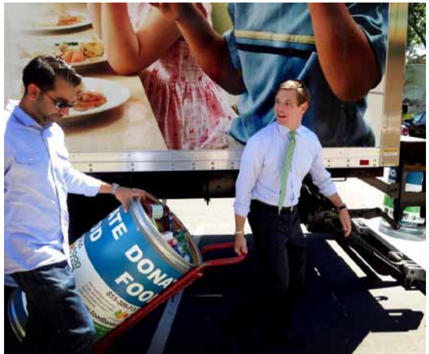
A food drive at Peace Lutheran Church in Danville and House Representative Eric Swalwell assisting with a large food drive at the San Ramon Valley Islamic Center.