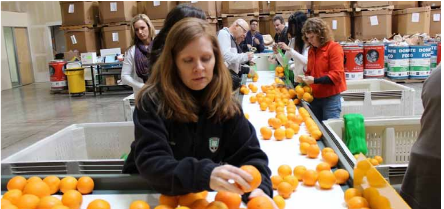
Clockwise from top left - Senior Food Program volunteers, Boy Scouts volunteer and hold food drives, KRAFT and Safeway volunteers in Fairfield