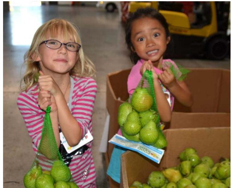
Young volunteers bagging pears for the Community Produce Program

Please let Joan at the Food Bank know about your drive, so we can assist you. We are happy to drop off collection boxes or a barrel and pick them up when your drive is complete, we will even let you know how many pounds of food you collected! Joan can be reached at – jtomasini@foodbankccs.org or call 925-676-7543 ext 208.