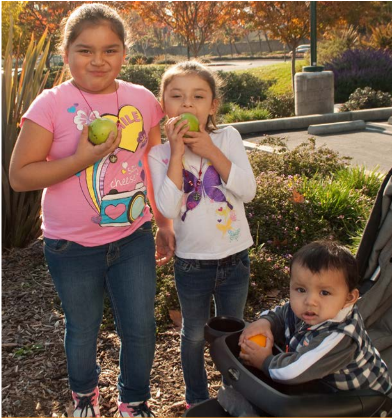
Children enjoy a variety of produce from Food Bank distributions.

Lindsey works full-time but struggles to buy healthy food. She says, "The (Community Produce Program) means I can serve my kids awesome fresh meals. The kids love fruits and veggies, but they can be expensive and take up a big chunk of our small budget. I am thrilled to now have fresh produce delivered to my neighborhood, walking distance to my home."